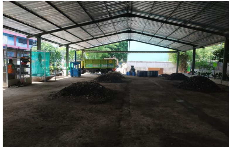
Figure 2 Field Documentation of the project location; open space areal/ outdoor (left), Semi outdoor space (right)